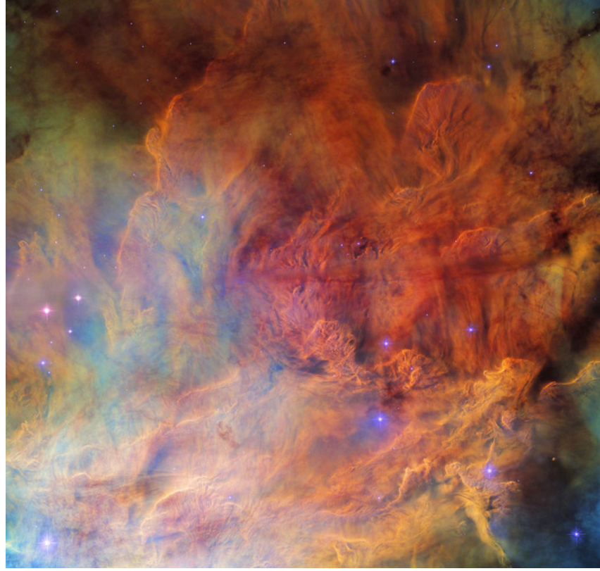
"Hubble Views a Star-Studded Cosmic Cloud"

Together with an extensive member network and multiple partners, we build capacity, we develop practical solutions, and we advocate for open sharing of education, culture, and science that serves the public interest. As part of this work, we help overcome legal obstacles to the sharing of knowledge and creativity to address the world's most pressing challenges.