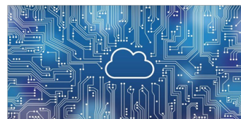
Informatique en nuage (cloud computing)