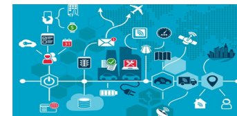
Ouverture et circulation des données, algorithmes et codes sources