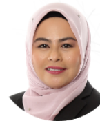
Official Opening DATUK SERI DR. NORAINI BINTI AHMAD MINISTER OF HIGHER EDUCATION